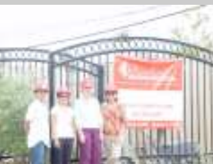
During a site visit at Leer Ct.

We’re up to 50 jobs for the year, now that’s a big accomplishment for a new business in the first four months. We had our drawing templates almost completed our forms in one database file and have made a good start at writing work instructions.