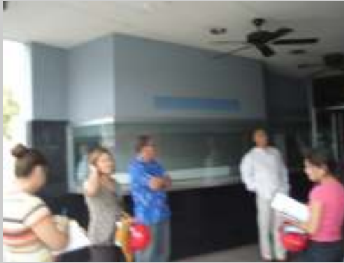
Photo outside of the Muse during a site visit last July.

new steel support frame to resist both roof and wall loads above the openings. The existing perimeter foundation was unknown, therefore, a new continuous footing was designed to provide adequate support. Lateral loads to resist storage loads will be supported by new wood shear walls, supported on new continuous footing designed to resist the storage loading for the existing floor space. The Muse will be a nice addition to Modesto.