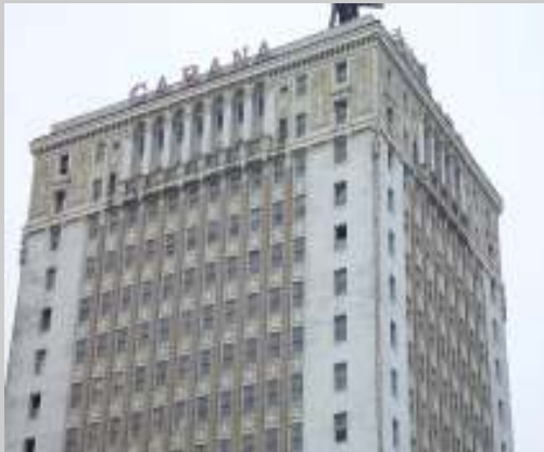
Photo of the old Cabana Building now turning into luxury condominium Leer Tower.

Leer Tower is a 149,741 square foot luxury condominium located in Birmingham, Alabama. Built in 1927, the exquisite 20 story building was originally designed and built as the Thomas Jefferson hotel, costing over two million dollars and regarded as one of the country's most elaborate structures.